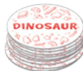
Set with Long Words

This simple and quick game is great for everyone: for kids who do not know how to read yet and those who just begin their studies, as well as for kids and adults who want to improve their speed reading skills.