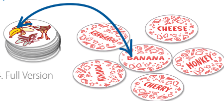
Fig. 4. Full Version

All tokens are placed on the table word-side up, but the players look at the pictures on their tokens. The players' objective is to find the tokens with names of the pictures that are drawn on their top tokens.