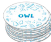
Set with Short Words